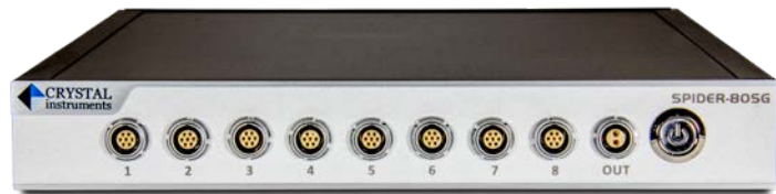
Figure 1.2 The Spider-80SG 8-channel strain gage front-end module