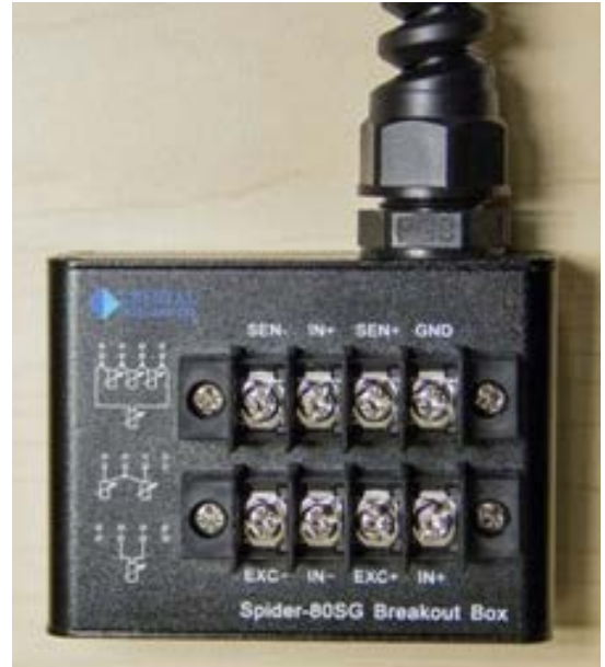
Figure 1.3 1 of 8 included Input Channel Adaptors, a breakout box to interface gage wires

The "big picture" item here is that up to eight strain gage installations are managed by a single Spider-80SG. This includes bridge-nulling (output zeroing) and precision resistive-shunt calibration upon networked computer command. The output of each gage is (simultaneously) sampled with 24-bit resolution at a selectable sample rate of 0.48 Hz to 102.4 kHz. The resulting digital data streams are stored in 32-bit floating point format and are available for FFT, 1/nth octave or shock response spectrum (SRS) analysis. A monitoring system can include one or more Spider-80SG front-ends working in consort with Spider-80x 8-channel analog/IEPE (ICP) input modules. Spider-80SG is an extremely capable Ethernet-networked component with IEEE 1588v2 capability permitting it